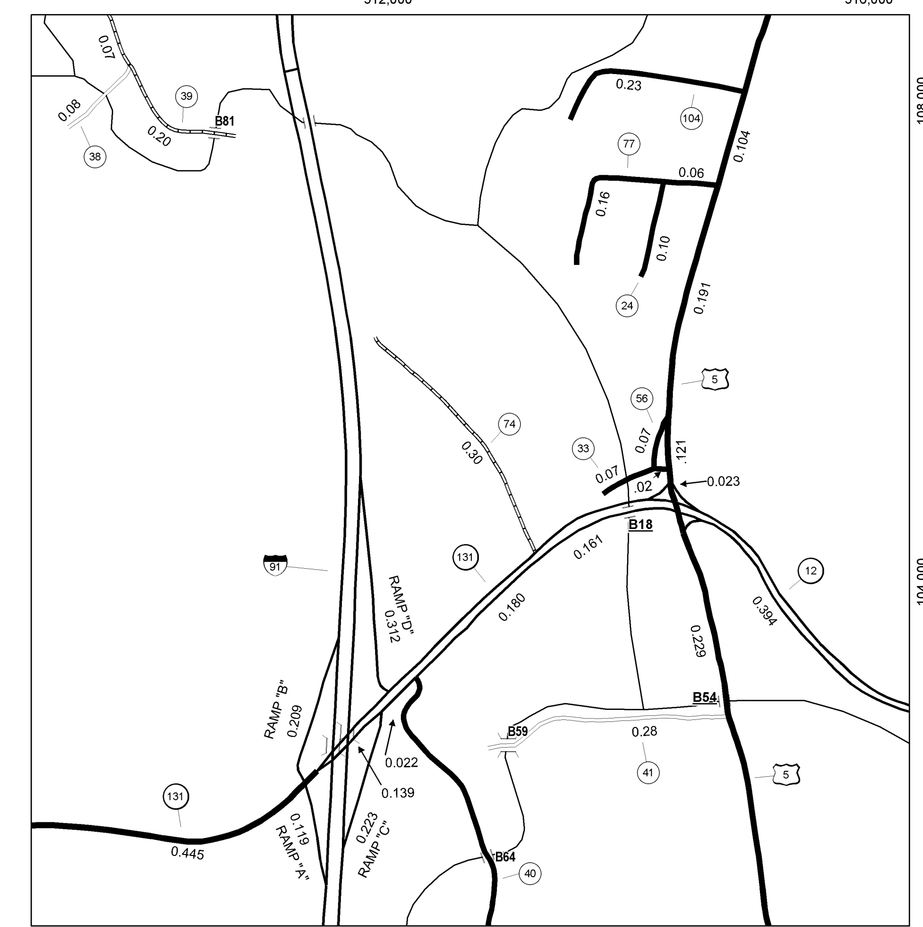
ASCUTNEY INSET 1 SCALE 1:6336 0 0.125 0.25 Miles SCALE FOR INSETS (UNLESS OTHERWISE NOTED)