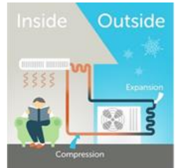
Figure 1: Illustration of how cold-climate heat pumps work.

COLD-CLIMATE HEAT PUMPS: Also referred to as air-source heat pumps, mini-splits or ductless heat pumps. These systems are a good option to retrofit existing houses, and can be used to supplement the existing heating system. As explained on the Efficiency Vermont website , “heat is collected from the exterior air, concentrated via an outdoor compressor, and distributed inside through an indoor room unit. Heat pumps require electricity to run, but can deliver more energy than they use.” They also provide air conditioning during the warmer months. See Figure 1.