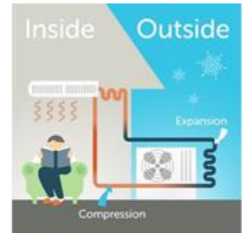
Figure 1: Illustration of how cold-climate heat pumps work.

COLD-CLIMATE HEAT PUMPS: Also referred to as air-source heat pumps, mini-splits or ductless heat pumps. These systems are a good option to retrofit existing houses, and can be used to supplement the existing heating system. As explained on the Efficiency Vermont website , “heat is collected from the exterior air, concentrated via an outdoor compressor, and distributed inside through an indoor room unit. Heat pumps require electricity to run, but can deliver more energy than they use.” They also provide air conditioning during the warmer months. See Figure 1.