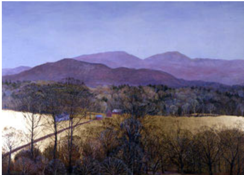
View from Studio

Adopted – June 16, 2009 Effective – July 21, 2009