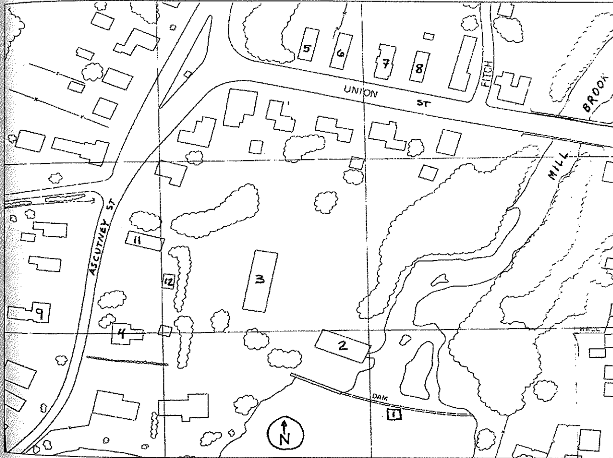
Site map 2 of 3 for "Industrial Sites on the Mill Brook Historic District": Site 10